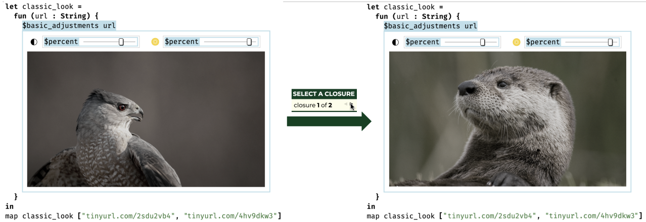
Figure 2. Case Study: Image Transformation. The image shown is determined based on the selected closure.

let len = strlen <splice> in if len > 0 then Some (<splice2> + len) else None